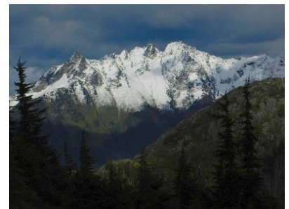
Images: Dewey Lake, off the Chinook Pass Scenic Byway (top right) Mt. Baker Scenic Highway (bottom)

All scenic byways exhibit one or more of six core intrinsic qualities — scenic, historic, recreational, cultural, archaeological, or natural. For a road to be named a national scenic byway , it must first be designated a state, tribal, or federal agency scenic byway . Once achieving that, a road may apply for national scenic byway designation, but its intrinsic quality must be of regional significance. All-American Roads are the very best of the national scenic byways, demonstrating at least two intrinsic qualities of national significance.