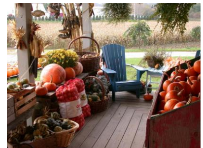
Images: Lake Champlain Byway (top), Harlow's Farm Stand via Connecticut River Byway (bottom)