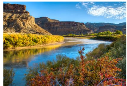
Images: Delicate Arch, Arches NP (top), Colorado Recreational River (bottom)