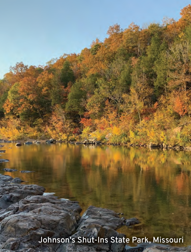
Johnson's Shut-Ins State Park, Missouri