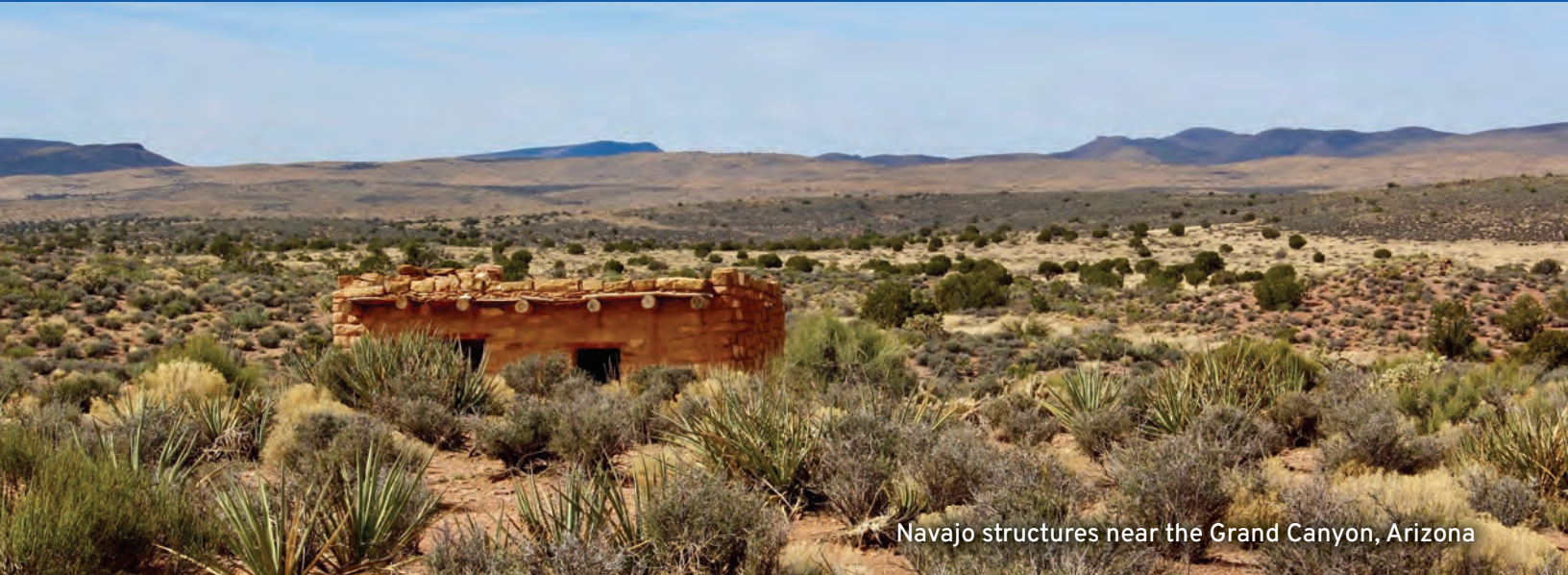
Navajo structures near the Grand Canyon, Arizona

Scenic America believes that all people deserve to live, work, and play in beautiful places—and we offer our gratitude to the Native peoples who teach us, by example, how to revere and respect the beauty all around us.