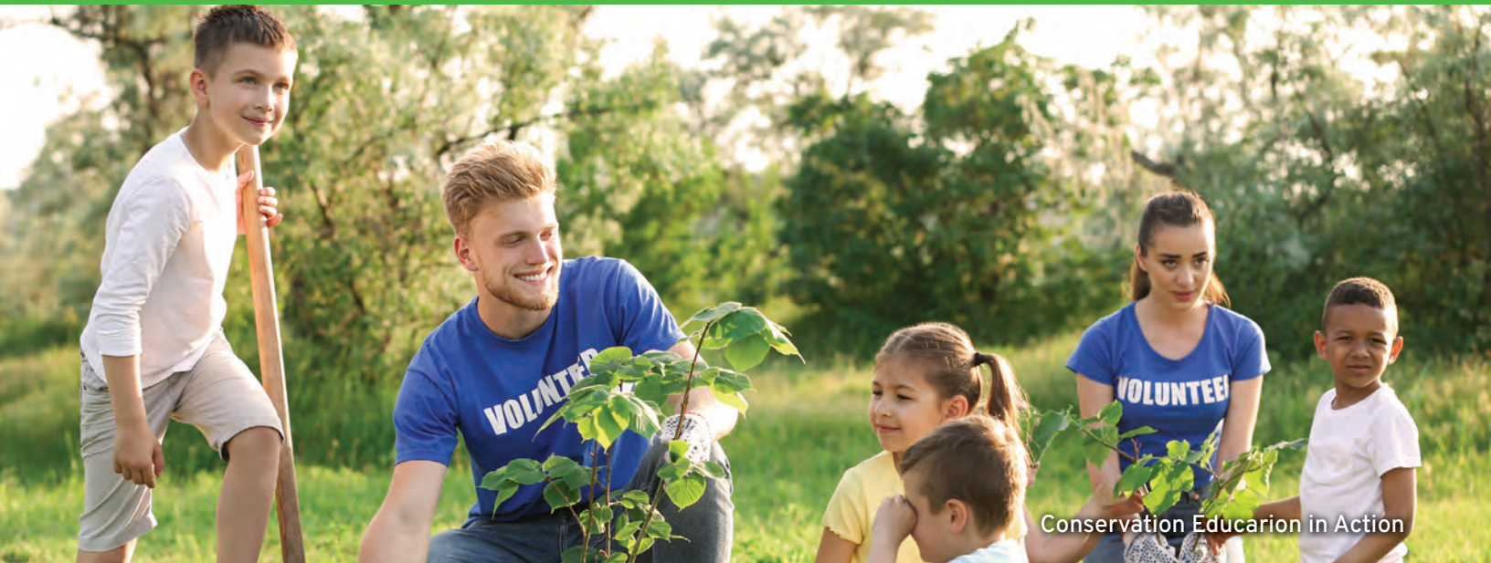
Conservation Education in Action

CREATING SCENIC EDUCATION FOR ALL AMERICANS