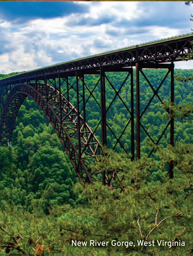
New River Gorge, West Virginia