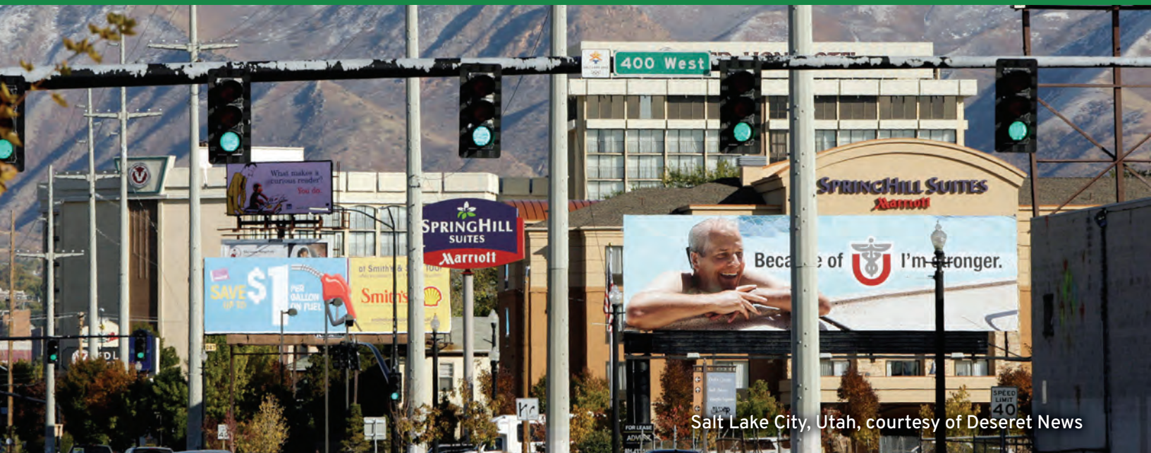
Salt Lake City, Utah