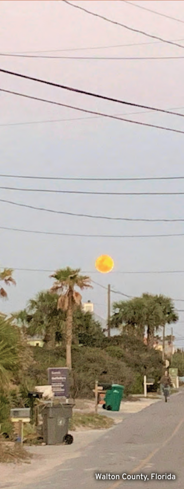
Walton County, Florida