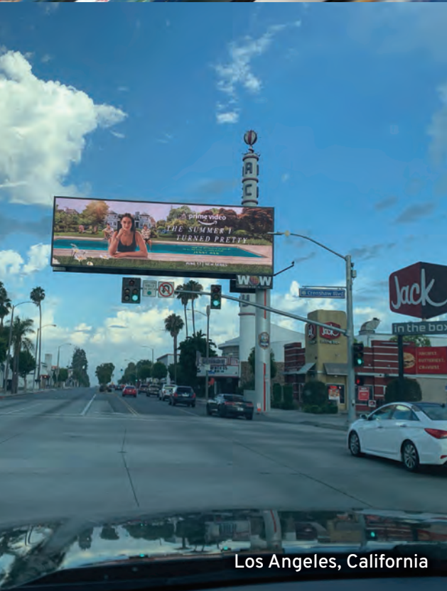
Los Angeles, California