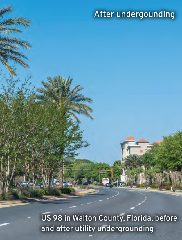
US 98 in Walton County, Florida, before and after utility undergrounding