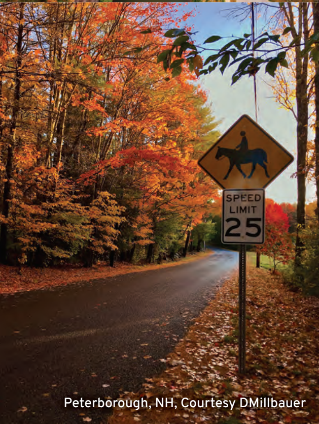
Peterborough, NH