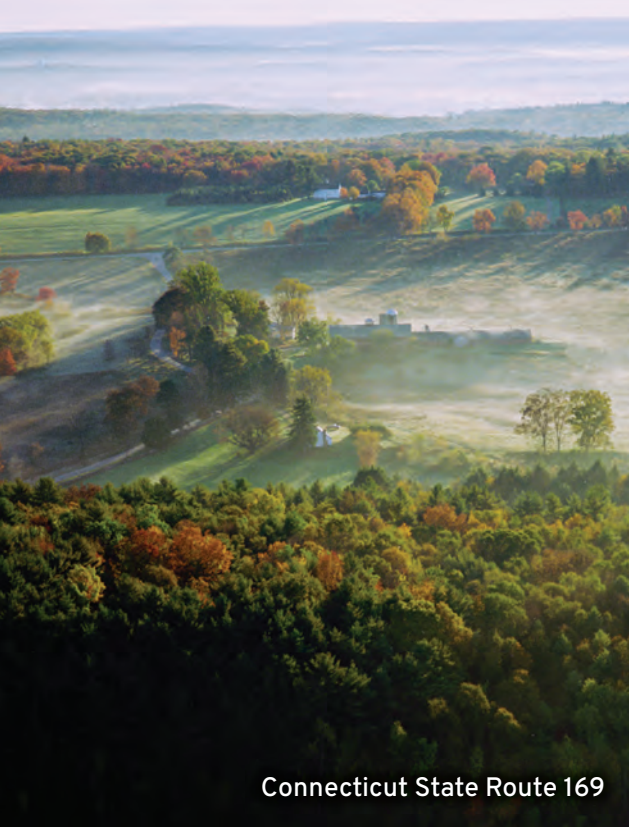
Connecticut State Route 169