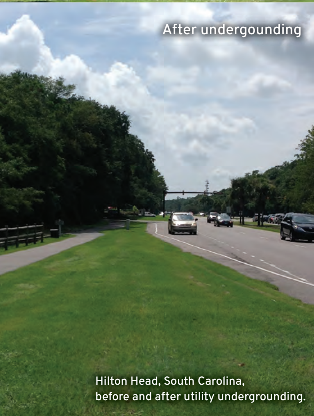
Hilton Head, South Carolina, before and after utility undergrounding.