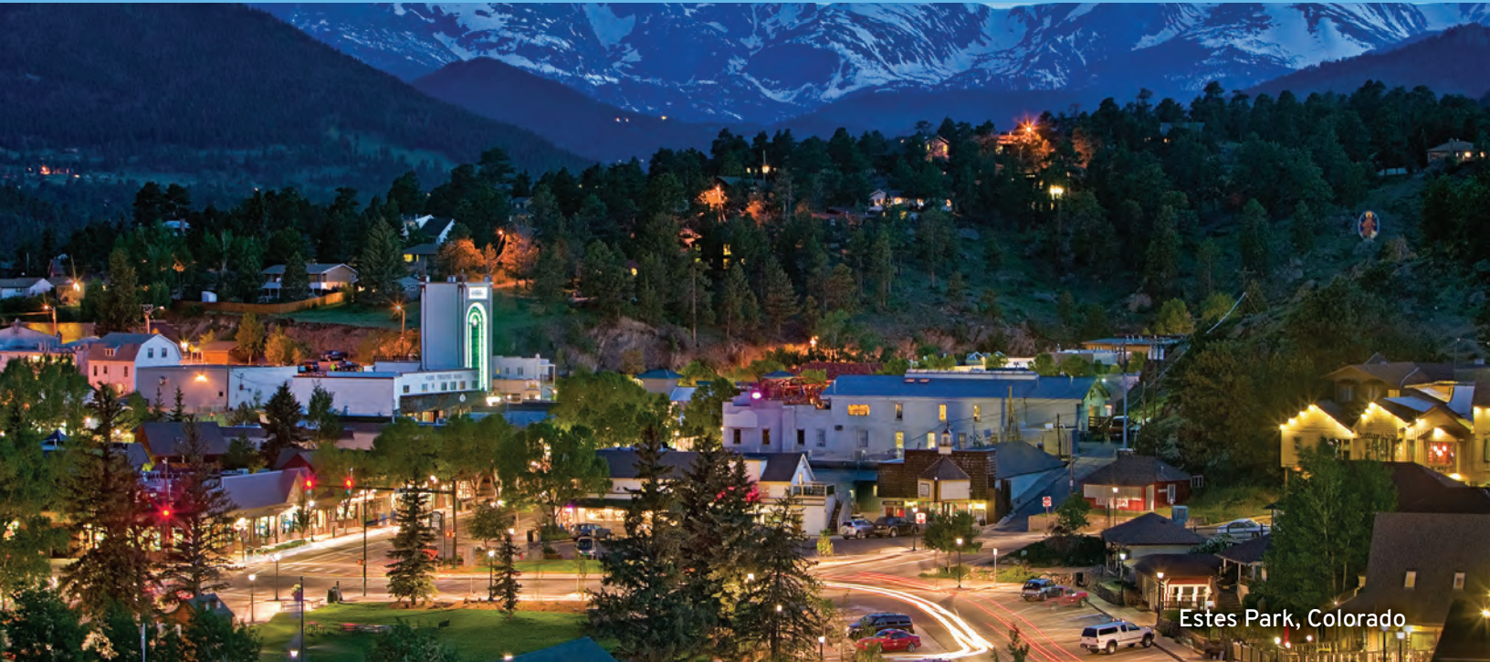
Estes Park, Colorado