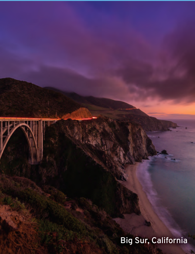
Big Sur, California