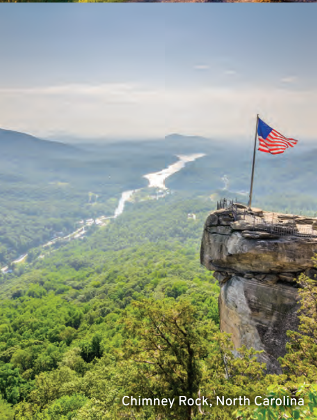
Chimney Rock, North Carolina