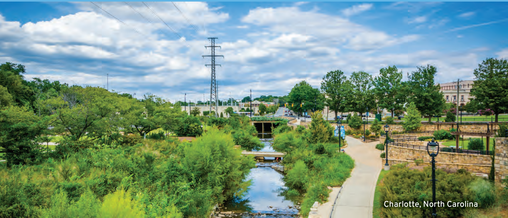
Charlotte, North Carolina