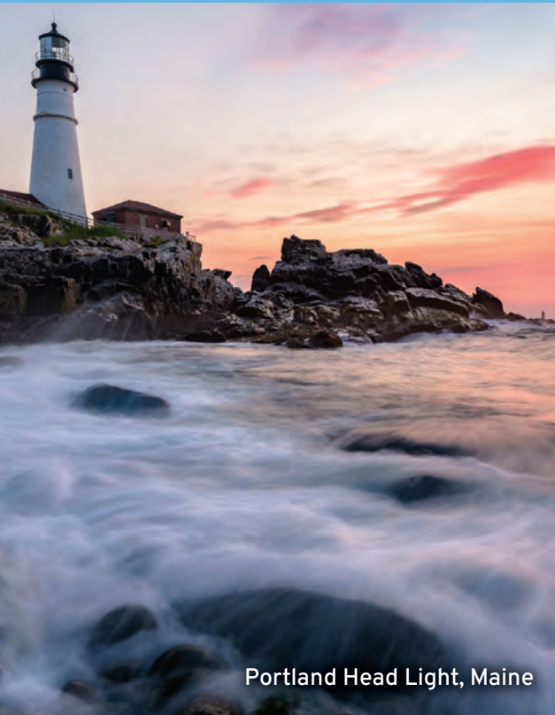
Portland Head Light, Maine