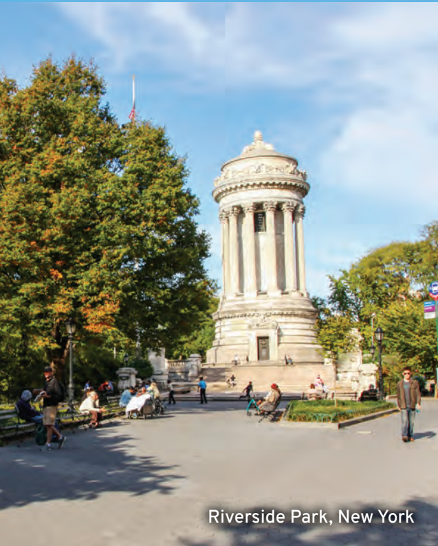
Riverside Park, New York