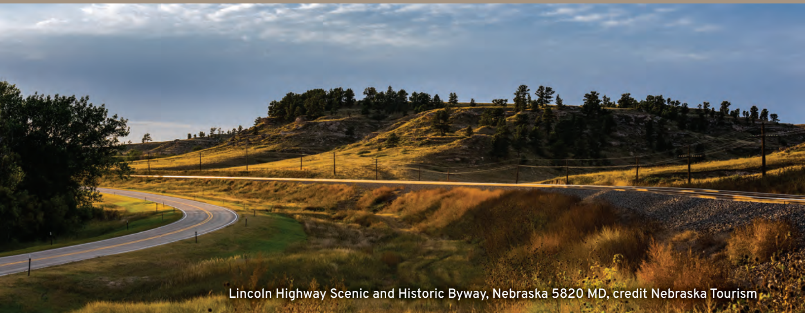
Lincoln Highway Scenic and Historic Byway, Nebraska 5820 MD