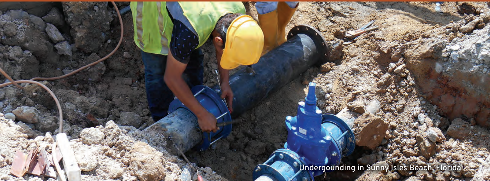
Undergrounding in Sunny Isles Beach, Florida