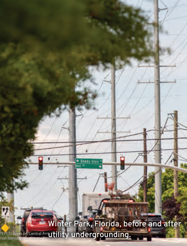
Winter Park, Florida, before and after utility undergrounding.