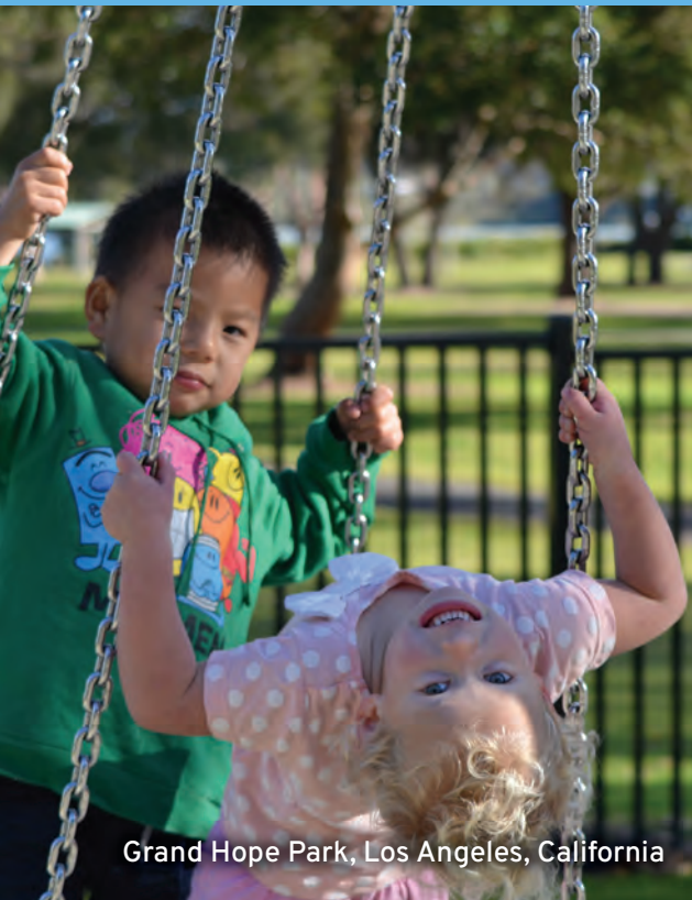
Grand Hope Park, Los Angeles, California