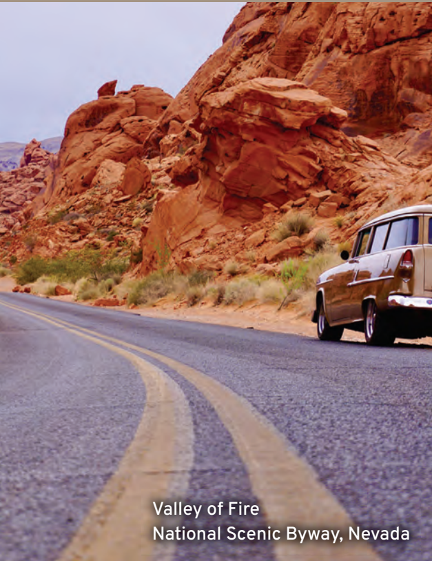
Valley of Fire National Scenic Byway, Nevada