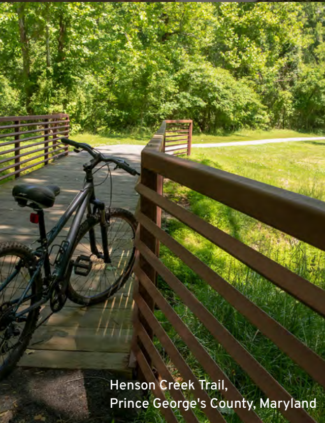
Henson Creek Trail, Prince George's County, Maryland