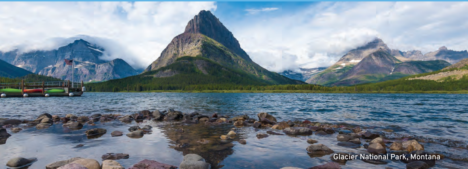
Glacier National Park, Montana