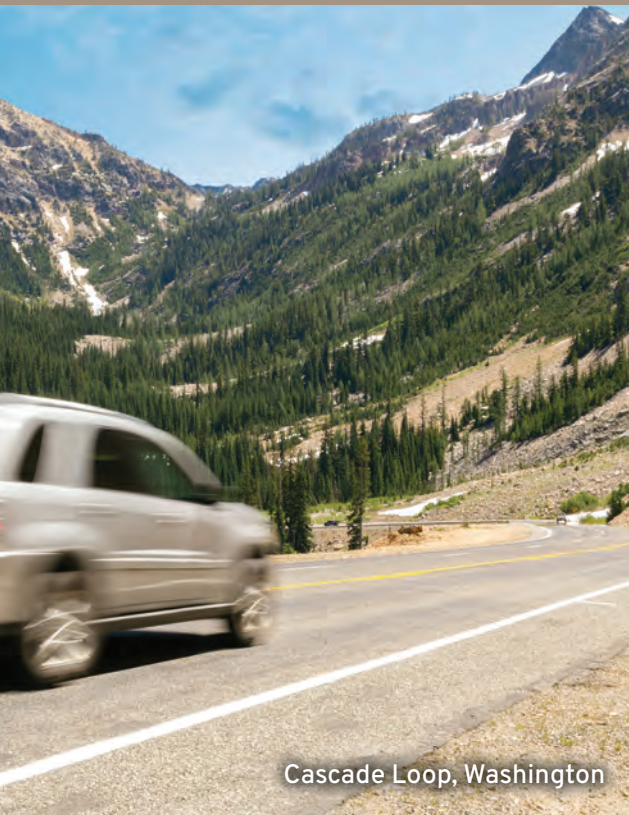
Cascade Loop, Washington