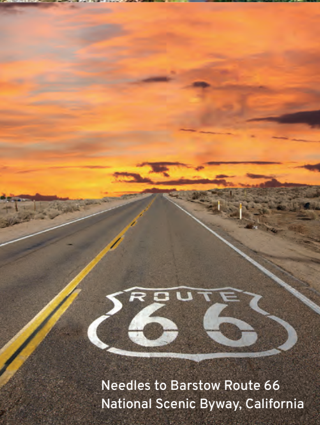
Needles to Barstow Route 66 National Scenic Byway, California