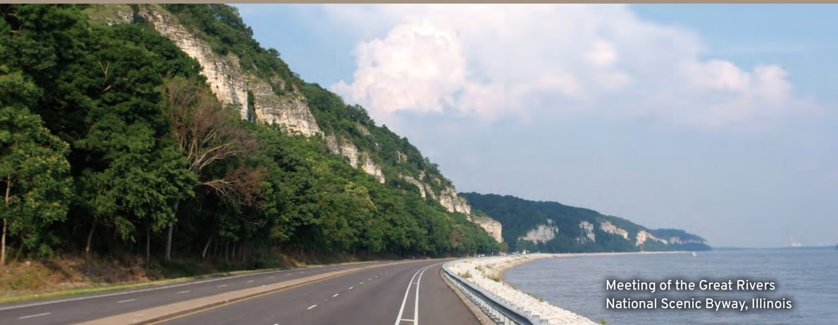
Meeting of the Great Rivers National Scenic Byway, Illinois