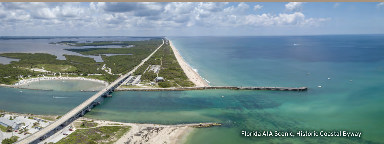
Florida A1A Scenic, Historic Coastal Byway