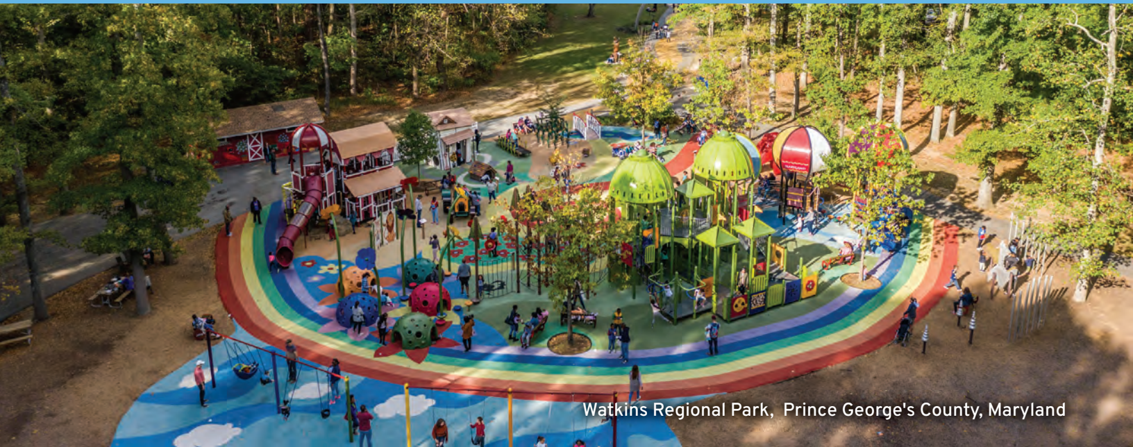
Watkins Regional Park, Prince George's County, Maryland