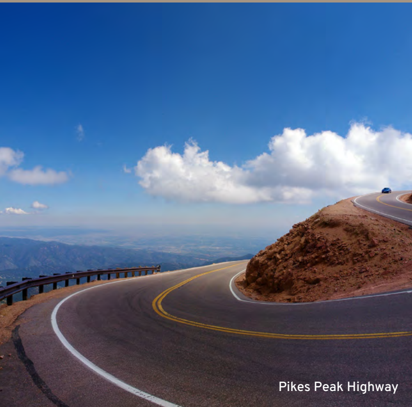
Pikes Peak Highway