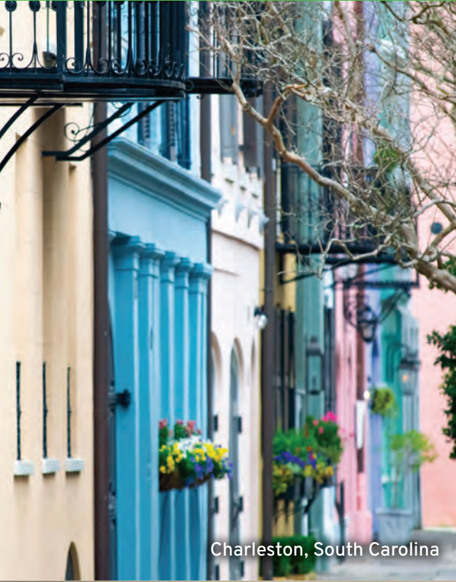
Charleston, South Carolina