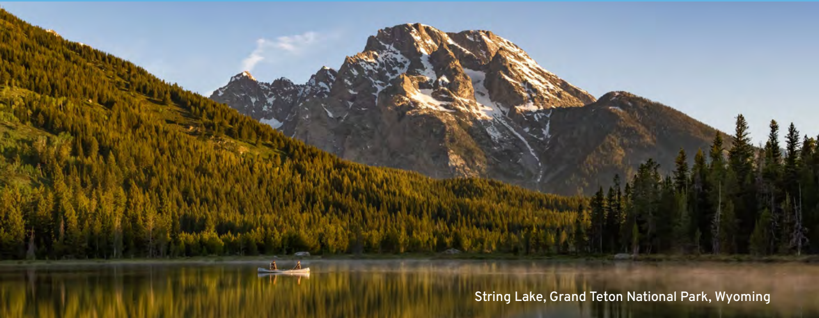
String Lake, Grand Teton National Park, Wyoming