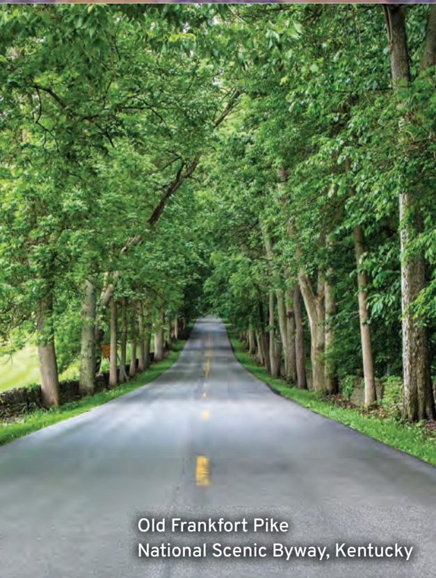
Old Frankfort Pike National Scenic Byway, Kentucky