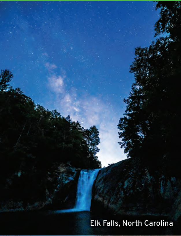
Elk Falls, North Carolina