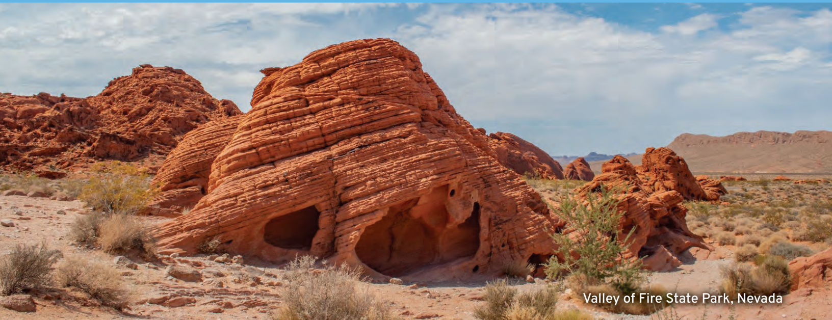
Valley of Fire State Park, Nevada