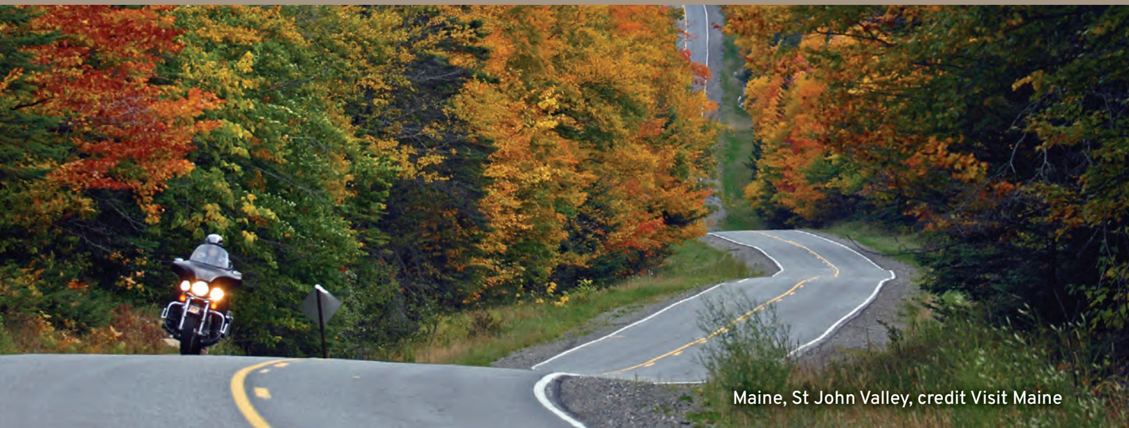
Maine, St John Valley