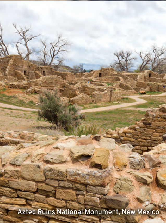
Aztec Ruins National Monument, New Mexico