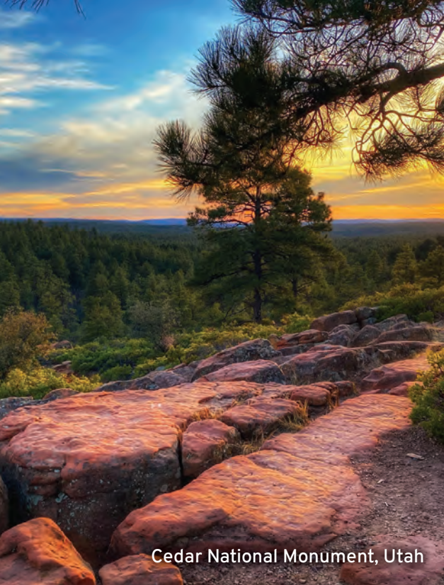
Cedar National Monument, Utah