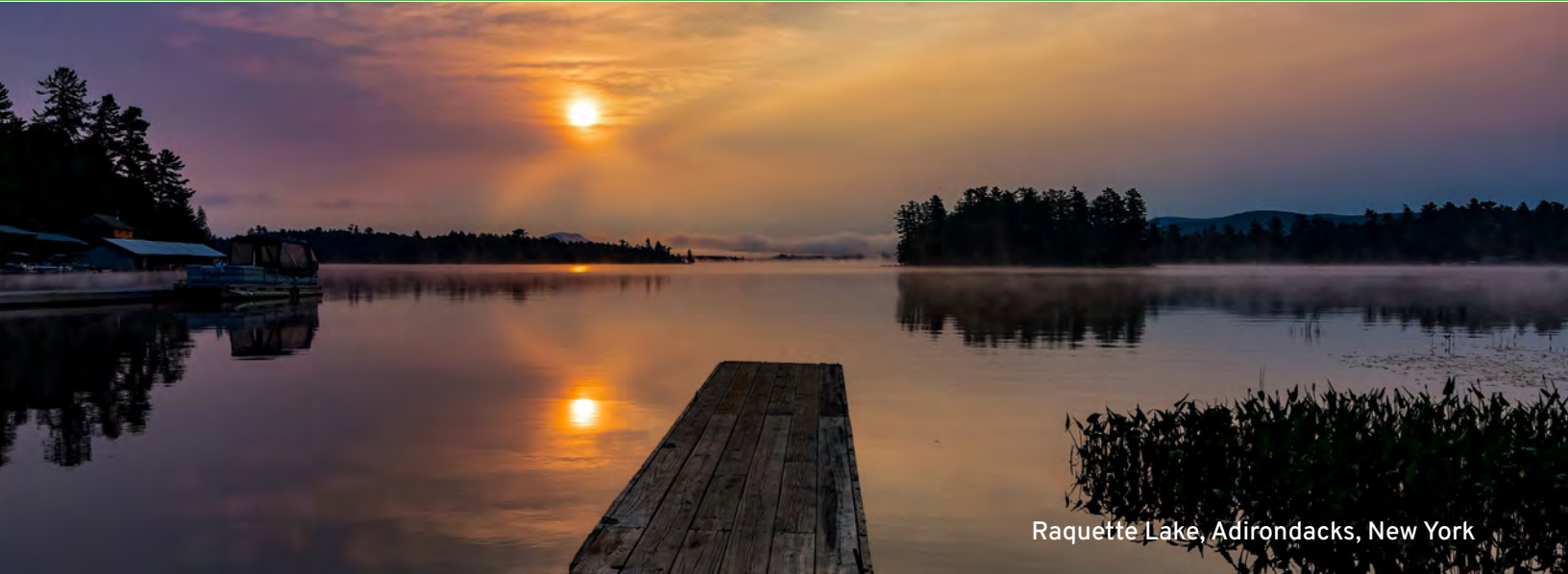
Raquette Lake, Adirondacks, New York