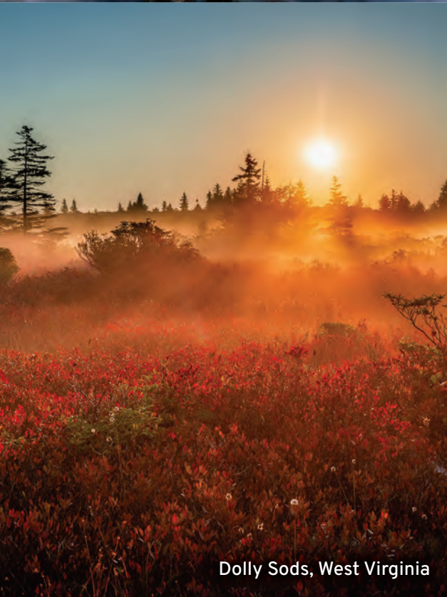
Dolly Sods, West Virginia