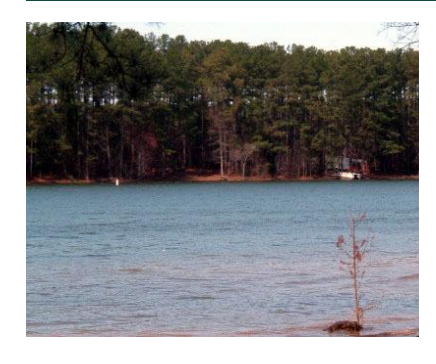
Images: Edisto Island Scenic Byway credit: National Archives (top), Savannah River Scenic Byway credit: National Archives (bottom)

727 15<sup>TH</sup> STREET NW, SUITE 1100 WASHINGTON, DC 20005 202.792.1300 SCENIC.ORG