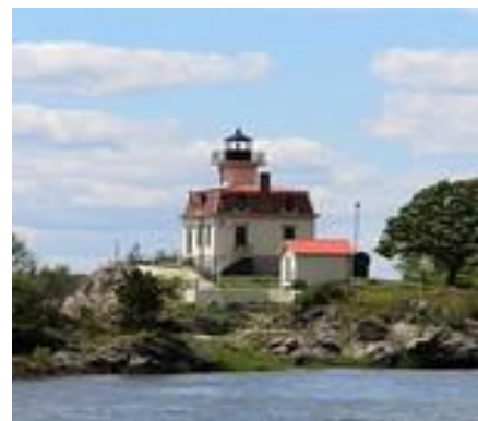
Images: Shannock Village (top), Pomham Rocks Lighthouse (bottom)