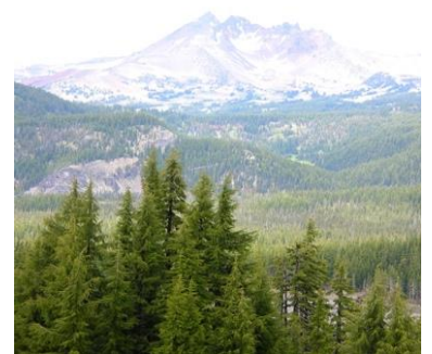
Images: Pacific Coast Scenic Byway credit: National Archives (top), Cascade Lakes Scenic Byway credit: National Archives (bottom)