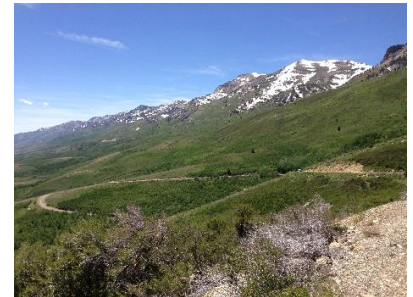
Images: U.S. 50 credit: Wikipedia (top), Angel Lake Road credit: Wikipedia (bottom)

All scenic byways exhibit one or more of six core intrinsic qualities — scenic, historic, recreational, cultural, archaeological, or natural. For a road to be named a national scenic byway , it must first be designated a state, tribal, or federal agency scenic byway . Once achieving that, a road may apply for national scenic byway designation, but its intrinsic quality must be of regional significance. All-American Roads are the very best of the national scenic byways, demonstrating at least two intrinsic qualities of national significance.