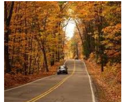
Images: General John Stark Byway, Currier and Ives Scenic Byway