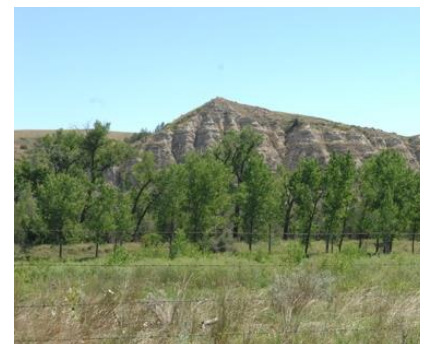
Images: Des Lacs National Wildlife Refuge Scenic Byway (top), Theodore Roosevelt NP (bottom)

All scenic byways exhibit one or more of six core intrinsic qualities — scenic, historic, recreational, cultural, archaeological, or natural. For a road to be named a national scenic byway , it must first be designated a state, tribal, or federal agency scenic byway . Once achieving that, a road may apply for national scenic byway designation, but its intrinsic quality must be of regional significance. All-American Roads are the very best of the national scenic byways, demonstrating at least two intrinsic qualities of national significance.