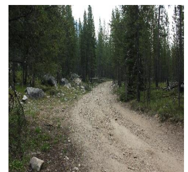
Images: Missouri Break Backcountry Byway (top), Pioneer Mountains Scenic Byway (bottom)