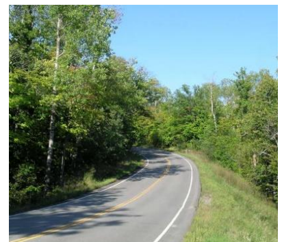
Images: Minnesota River Valley Scenic Byway credit: National Archives (top), Edge of the Wilderness credit: National Archives (bottom)