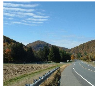
Images: Route 112/Lost Villages (top), Mohawk Trail (bottom)

All scenic byways exhibit one or more of six core intrinsic qualities — scenic, historic, recreational, cultural, archaeological, or natural. For a road to be named a national scenic byway , it must first be designated a state, tribal, or federal agency scenic byway . Once achieving that, a road may apply for national scenic byway designation, but its intrinsic quality must be of regional significance. All-American Roads are the very best of the national scenic byways, demonstrating at least two intrinsic qualities of national significance.