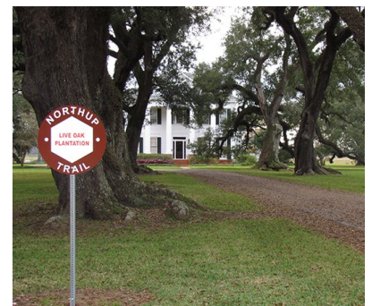
Images: Bayou Teche Byway credit: Parish CVB (top), Northup Trail (bottom)

All scenic byways exhibit one or more of six core intrinsic qualities — scenic, historic, recreational, cultural, archaeological, or natural. For a road to be named a national scenic byway , it must first be designated a state, tribal, or federal agency scenic byway . Once achieving that, a road may apply for national scenic byway designation, but its intrinsic quality must be of regional significance. All-American Roads are the very best of the national scenic byways, demonstrating at least two intrinsic qualities of national significance.