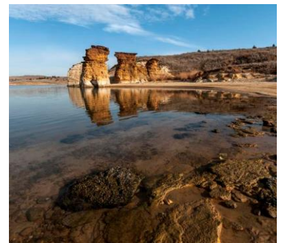
Images: Land and Sky Scenic Byway (top), Post Rock Scenic Byway (bottom)