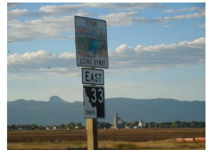
Images: City of Rocks Backcountry Byway (top), Teton Scenic Byway Sign (bottom)