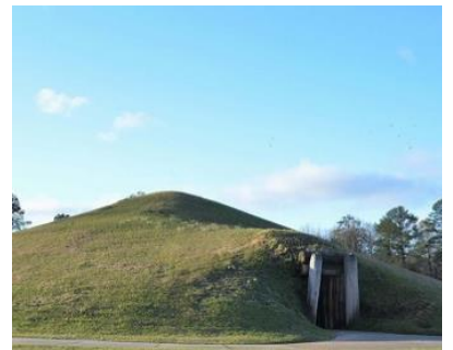
Images: Chattahoochee National Forest credit: Mitch Cohen (top), Ocmulgee National Monument (bottom)

All scenic byways exhibit one or more of six core intrinsic qualities — scenic, historic, recreational, cultural, archaeological, or natural. For a road to be named a national scenic byway , it must first be designated a state, tribal, or federal agency scenic byway . Once achieving that, a road may apply for national scenic byway designation, but its intrinsic quality must be of regional significance. All-American Roads are the very best of the national scenic byways, demonstrating at least two intrinsic qualities of national significance.