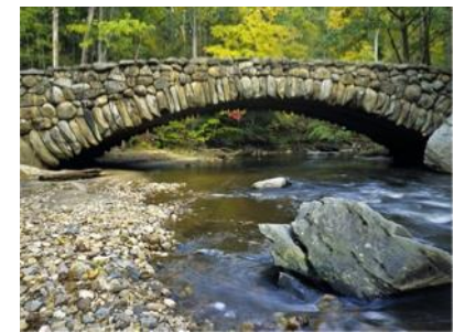
Images: Canal Road Byway (top right), Rock Creek Park Byway (bottom right)