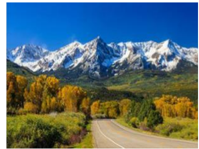
Images: Top of the Rockies (top right), Scenic Highway of Legends (bottom right)

All scenic byways exhibit one or more of six core intrinsic qualities — scenic, historic, recreational, cultural, archaeological, or natural. For a road to be named a national scenic byway , it must first be designated a state, tribal, or federal agency scenic byway . Once achieving that, a road may apply for national scenic byway designation, but its intrinsic quality must be of regional significance. All-American Roads are the very best of the national scenic byways, demonstrating at least two intrinsic qualities of national significance.