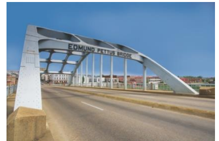
Images: Talladega Scenic Drive (top right), Selma to Montgomery March Byway (bottom right)