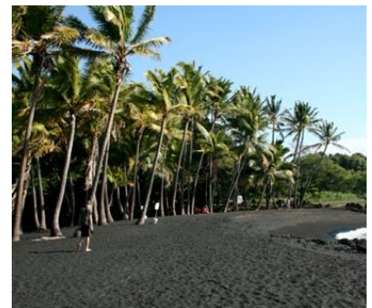
Images: Holo Holo Koloa Scenic Byway (top right) Ka'u Scenic Byway – The Slopes of Mauna Loa (bottom right)