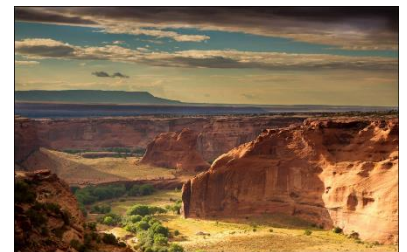
Images: Organ Pipe Cactus Parkway (top right), Canyon de Chelly via Diné Tah (bottom right)

All scenic byways exhibit one or more of six core intrinsic qualities – scenic, historic, recreational, cultural, archaeological, or natural. For a road to be named a national scenic byway , it must first be designated a state, tribal, or federal agency scenic byway . Once achieving that, a road may apply for national scenic byway designation, but its intrinsic quality must be of regional significance. All-American Roads are the very best of the national scenic byways, demonstrating at least two intrinsic qualities of national significance.