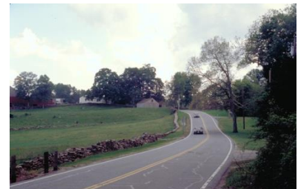
Images: Merritt Parkway (top right), Connecticut State Route 169 (bottom right)