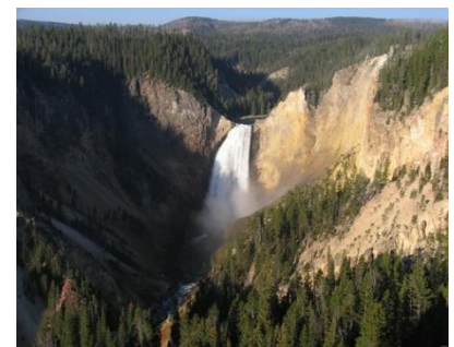
Images: Grand Teton National Park (top), Yellowstone National Park (bottom)

WYOMING BYWAYS PROVIDE ACCESS TO THE STATE'S MOST SPECTACULAR PUBLIC LANDS INCLUDING: > 2 NATIONAL PARKS > 13 STATE PARKS > 2 NATIONAL RECREATIONAL AREAS > 5 NATIONAL FORESTS > 4 NATIONAL WILDLIFE REFUGES