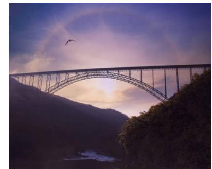
Images: Cathedral Falls on the Midland Trail (right), New River Gorge National Park (bottom right)

WEST VIRGINIA BYWAYS PROVIDE ACCESS TO THE STATE'S MOST SPECTACULAR PUBLIC LANDS INCLUDING: > 1 NATIONAL PARK > 29 STATE PARKS > 2 NATIONAL RECREATIONAL AREAS > 1 NATIONAL FOREST > 9 STATE FORESTS