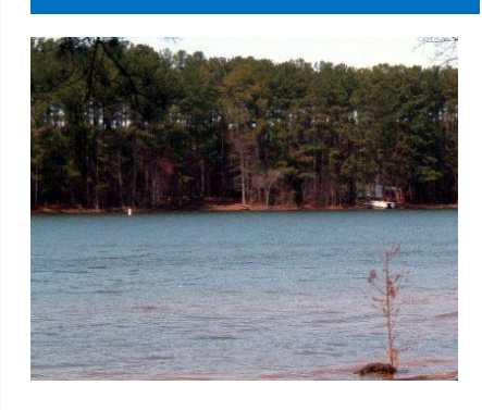
Images: Edisto Island Scenic Byway credit: <u>National Archives</u> (top), Savannah River Scenic Byway credit: <u>National Archives</u> (bottom)