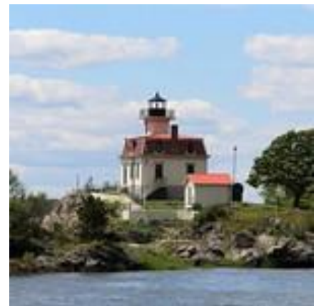
Images: Shannock Village (top), Pomham Rocks Lighthouse (bottom)