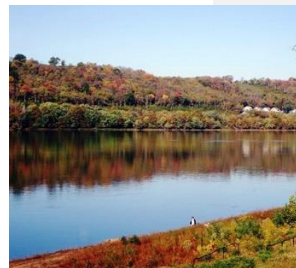
Images: Ohio and Erie Canalway credit: National Archives (top), Ohio River Scenic Byway credit: National Archives (bottom)

All scenic byways exhibit one or more of six core intrinsic qualities — scenic, historic, recreational, cultural, archaeological, or natural. For a road to be named a national scenic byway , it must first be designated a state, tribal, or federal agency scenic byway . Once achieving that, a road may apply for national scenic byway designation, but its intrinsic quality must be of regional significance. All-American Roads are the very best of the national scenic byways, demonstrating at least two intrinsic qualities of national significance.