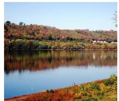
Images: Ohio and Erie Canalway credit: National Archives (top), Ohio River Scenic Byway credit: National Archives (bottom)