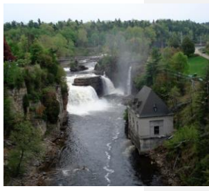
Images: Mohawk Towpath credit: National Archives (top), Lakes to Locks Passage credit: National Archives (bottom)

NEW YORK BYWAYS PROVIDE ACCESS TO THE STATE'S MOST SPECTACULAR PUBLIC LANDS INCLUDING: > 180 STATE PARKS > 7 NATIONAL MONUMENTS > 10 NATIONAL HISTORIC SITES > 4 NATIONAL SCENIC AND HISTORIC TRAILS > 1 NATIONAL SEASHORE