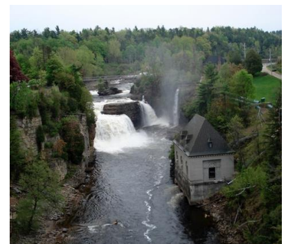
Images: Mohawk Towpath credit: National Archives (top), Lakes to Locks Passage credit: National Archives (bottom)

All scenic byways exhibit one or more of six core intrinsic qualities – scenic, historic, recreational, cultural, archaeological, or natural. For a road to be named a national scenic byway , it must first be designated a state, tribal, or federal agency scenic byway . Once achieving that, a road may apply for national scenic byway designation, but its intrinsic quality must be of regional significance. All-American Roads are the very best of the national scenic byways, demonstrating at least two intrinsic qualities of national significance.