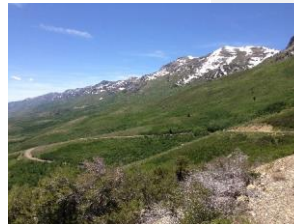
Images: U.S. 50 credit: Wikipedia (top), Angel Lake Road credit: Wikipedia (bottom)