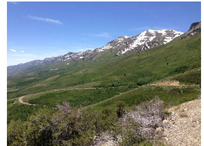
Images: U.S. 50 credit: Wikipedia (top), Angel Lake Road credit: Wikipedia (bottom)

All scenic byways exhibit one or more of six core intrinsic qualities – scenic, historic, recreational, cultural, archaeological, or natural. For a road to be named a national scenic byway , it must first be designated a state, tribal, or federal agency scenic byway . Once achieving that, a road may apply for national scenic byway designation, but its intrinsic quality must be of regional significance. All-American Roads are the very best of the national scenic byways, demonstrating at least two intrinsic qualities of national significance.