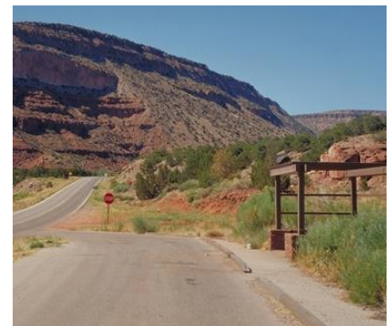
Images: Geronimo Trail credit: National Archives (top), Jemez Mountain Trail credit: National Archives (bottom)

All scenic byways exhibit one or more of six core intrinsic qualities — scenic, historic, recreational, cultural, archaeological, or natural. For a road to be named a national scenic byway , it must first be designated a state, tribal, or federal agency scenic byway . Once achieving that, a road may apply for national scenic byway designation, but its intrinsic quality must be of regional significance. All-American Roads are the very best of the national scenic byways, demonstrating at least two intrinsic qualities of national significance.