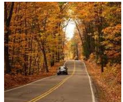
Images: General John Stark Byway (top), Currier and Ives Scenic Byway (bottom)