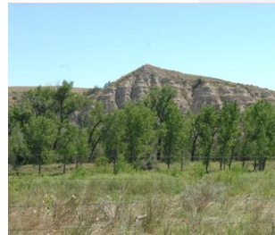
Images: Des Lacs National Wildlife Refuge Scenic Byway (top), Theodore Roosevelt NP credit: National Archives (bottom)

All scenic byways exhibit one or more of six core intrinsic qualities — scenic, historic, recreational, cultural, archaeological, or natural. For a road to be named a national scenic byway , it must first be designated a state, tribal, or federal agency scenic byway . Once achieving that, a road may apply for national scenic byway designation, but its intrinsic quality must be of regional significance. All-American Roads are the very best of the national scenic byways, demonstrating at least two intrinsic qualities of national significance.