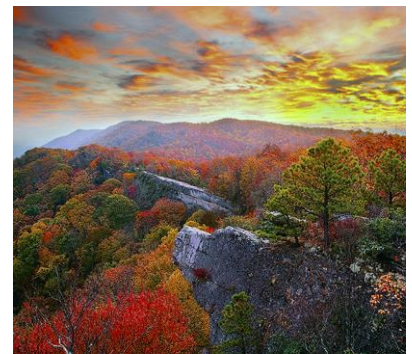
Images: Lincoln Heritage Scenic Highway (top), Pine Mountain State Scenic Trail (bottom)

All scenic byways exhibit one or more of six core intrinsic qualities — scenic, historic, recreational, cultural, archaeological, or natural. For a road to be named a national scenic byway , it must first be designated a state, tribal, or federal agency scenic byway . Once achieving that, a road may apply for national scenic byway designation, but its intrinsic quality must be of regional significance. All-American Roads are the very best of the national scenic byways, demonstrating at least two intrinsic qualities of national significance.