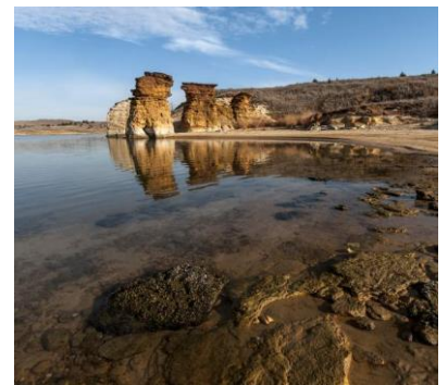
Images: Land and Sky Scenic Byway (top), Post Rock Scenic Byway (bottom)