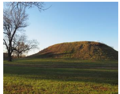
Images: Illinois River Road (top), Meeting of the Great Rivers Scenic Route (middle), Cahokia Mounds on Historic National Road credit: Wikimedia Commons (bottom)

All scenic byways exhibit one or more of six core intrinsic qualities — scenic, historic, recreational, cultural, archaeological, or natural. For a road to be named a national scenic byway , it must first be designated a state, tribal, or federal agency scenic byway . Once achieving that, a road may apply for national scenic byway designation, but its intrinsic quality must be of regional significance. All-American Roads are the very best of the national scenic byways, demonstrating at least two intrinsic qualities of national significance.