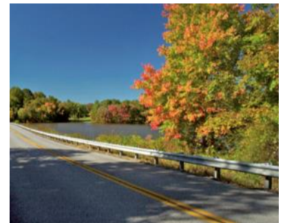
Images: Historic Lewes Byway credit: Cape Gazette (top right), Red Clay Scenic Byway credit: Gaadt Perspectives (bottom right)