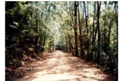
Images: Talimena Scenic Drive (top right), Great River Road (bottom right)

All scenic byways exhibit one or more of six core intrinsic qualities — scenic, historic, recreational, cultural, archaeological, or natural. For a road to be named a national scenic byway , it must first be designated a state, tribal, or federal agency scenic byway . Once achieving that, a road may apply for national scenic byway designation, but its intrinsic quality must be of regional significance. All-American Roads are the very best of the national scenic byways, demonstrating at least two intrinsic qualities of national significance.