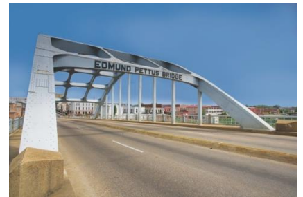
Images: Talladega Scenic Drive (top right), Selma to Montgomery March Byway (bottom right)