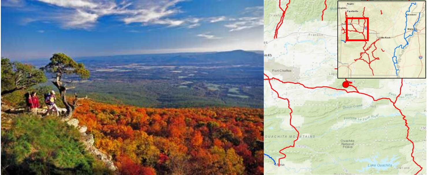
Mount Magazine Scenic Byway offers access to a multitude of hiking trails.