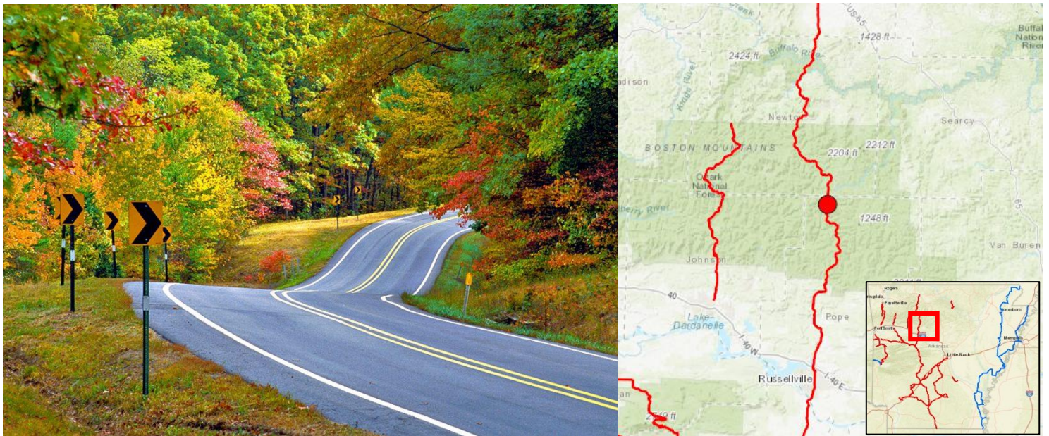
Arkansas 7 Scenic Byway, ranked one of the most scenic drives in America, offers stunning views of Arkansas' picturesque forests.