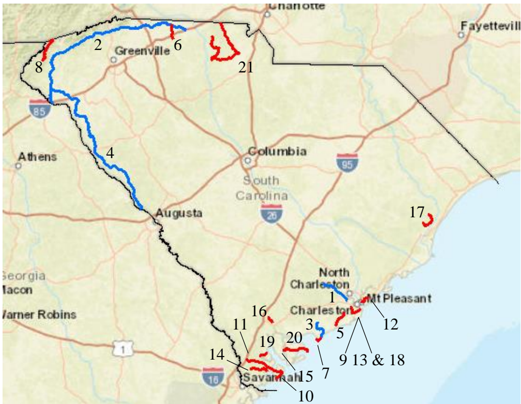
Scenic Byways in South Carolina