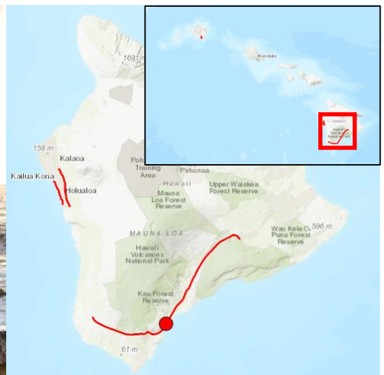
Kau Scenic Byway-The Slopes of Mauna Loa offers breathtaking views of the coast and access to some of Hawaii's historic landmarks.