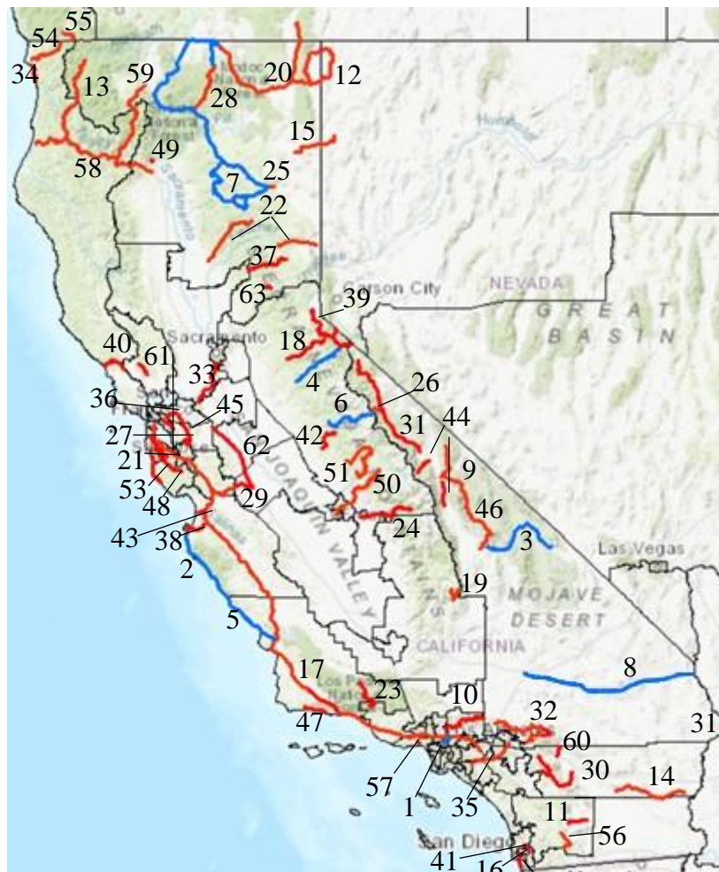
Scenic Byways in California