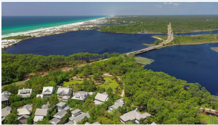
Scenic Highway 30A in Florida parallels the Gulf of Mexico and is trimmed with white sand beaches.