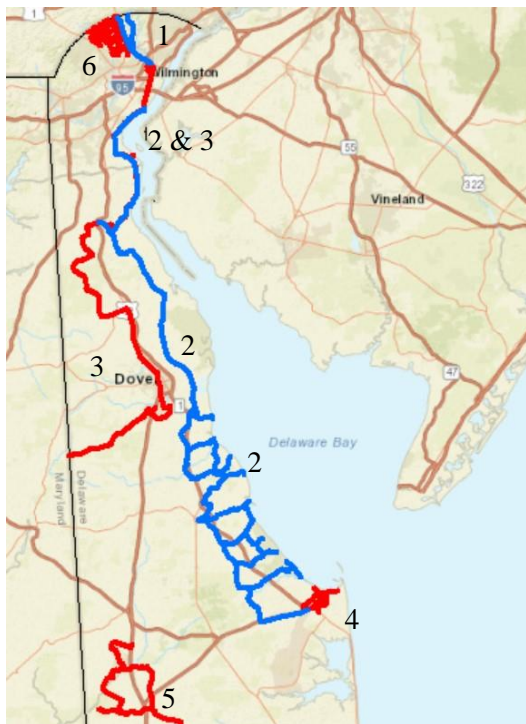
Scenic Byways in Delaware