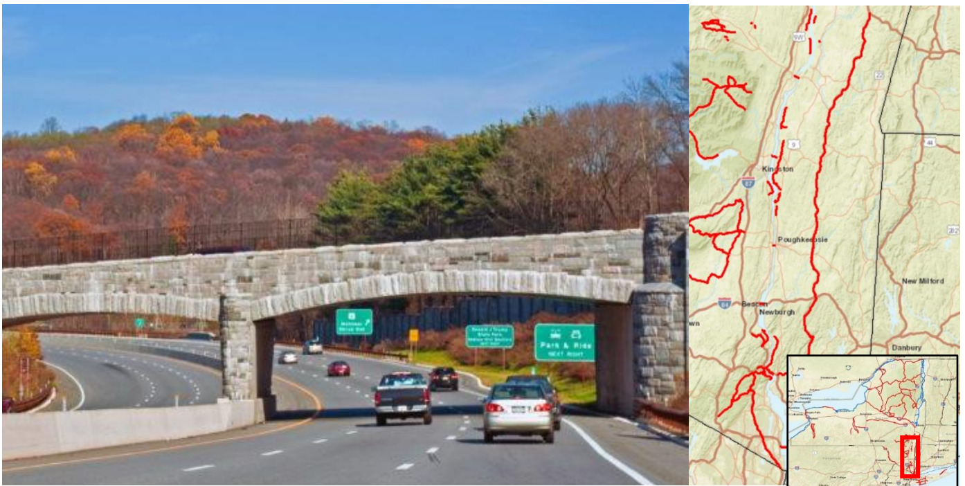
The Taconic Parkway is an Eastern Hudson scenic byway with fascinating autumn scenery connecting Interstate 90 to lower New York's Parkways in Valhalla.