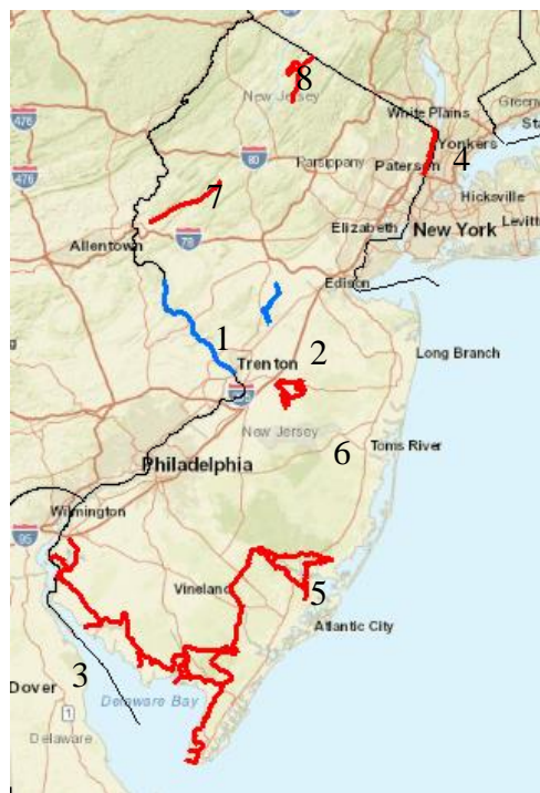
Scenic Byways in New Jersey